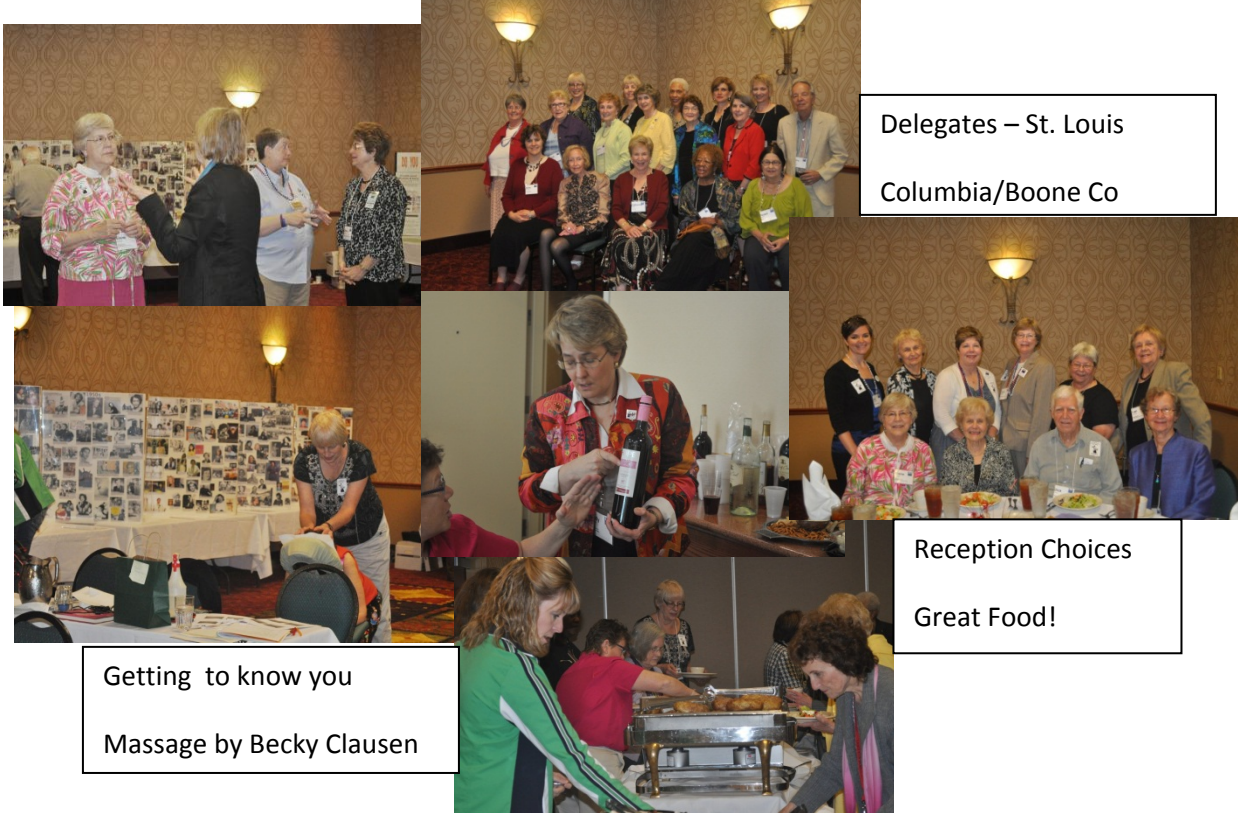
Delegates – St. Louis Columbia/Boone Co

Words cannot express all the new friendships made, lively discussions, and overall wonderful experiences all attendees had. So look at the pictures.